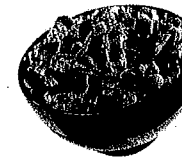
Grilled Teriyaki Chicken