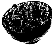
Grilled Teriyaki Chicken